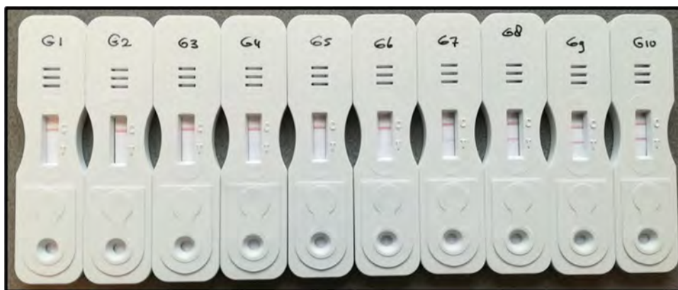
Fig. 1. The G-scores; a set of 10 POC-CCA cassettes consisting of artificially produced strips with different test line intensities. The colours depicted here might differ from the actual printed cassettes. Therefore this figure should not be used as a replacement of the G-scores.