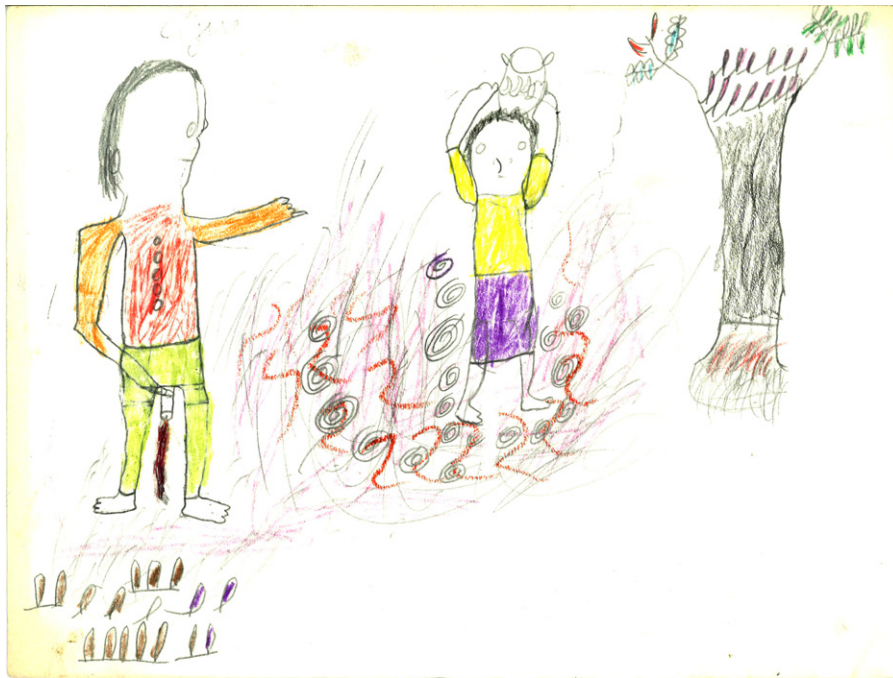
Fig. 1. The schistosome life cycle as perceived by an 11-year-old schoolgirl living in Fagnamplou, western Côte d'Ivoire. Of note, key elements how schistosomiasis is deeply embedded in social (e.g. open human waste elimination and water contact patterns) and ecological systems (e.g. people are living in close proximity to freshwater bodies inhabited by intermediate host snails) are clearly depicted.

A deeper understanding of these social and behavioural patterns, along with knowledge, attitudes, beliefs and practices, are crucial for the design and implementation of local, setting-specific policies and strategies for the prevention and control of schistosomiasis (Huang and Manderson, 2005; Bruun and Aagaard-Hansen, 2008; Aagaard-Hansen et al., 2009; Manderson et al., 2009). Moreover, we conjecture that, for teaching purposes and raising local awareness, the life cycle as depicted in Fig. 1 is appealing and of more immediate impact in contrast to the technical life cycles presented in textbooks and the peer-reviewed literature (for recent examples, see: Gryseels et al., 2006; Davis, 2009; McManus et al., 2010; Utzinger et al., 2010a). Thus, we speculate that for children and adults living in schistosome-endemic areas, hand-drawn life cycles are particularly instructive for disease prevention and control.